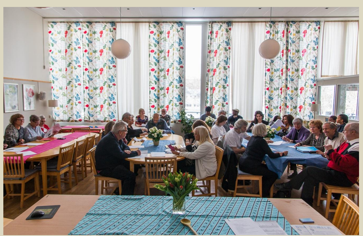
BOTSFA members during Annual General Meeting