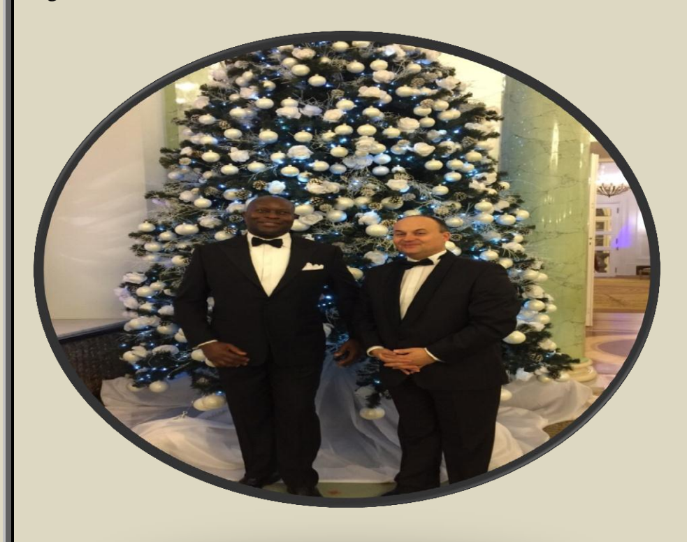
H.E with a colleague during presentation of Credentials in Poland