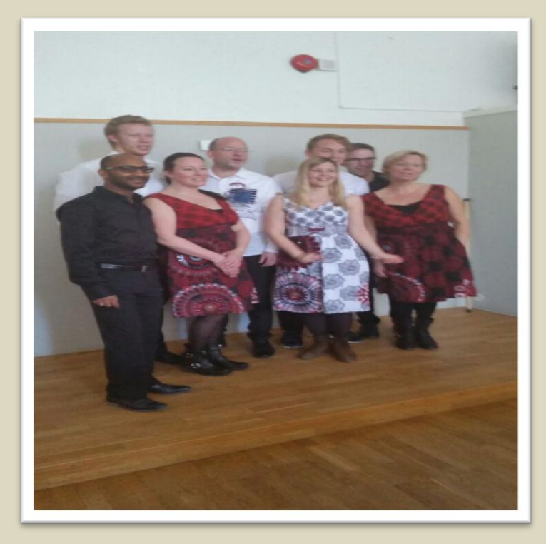
Blue Congo Choir during BOTSFA Annual General Meeting