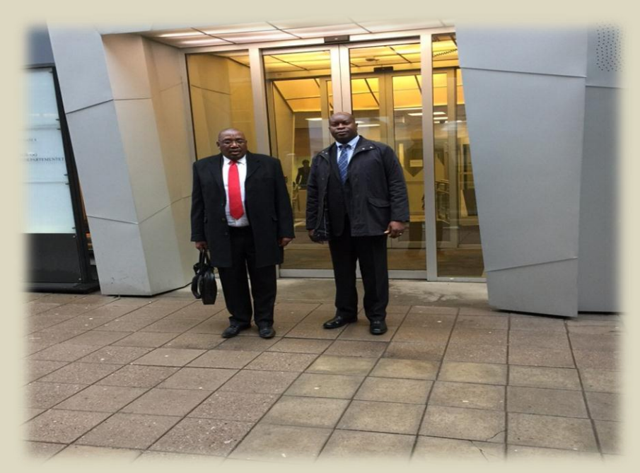
Minister of Trade Hon. V.T Seretse and Amb. Nthekela