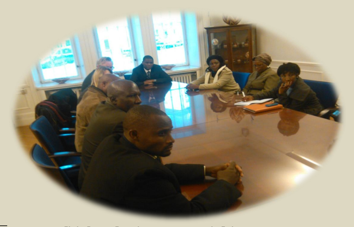
Chobe District Council paying courtesy on the Embassy