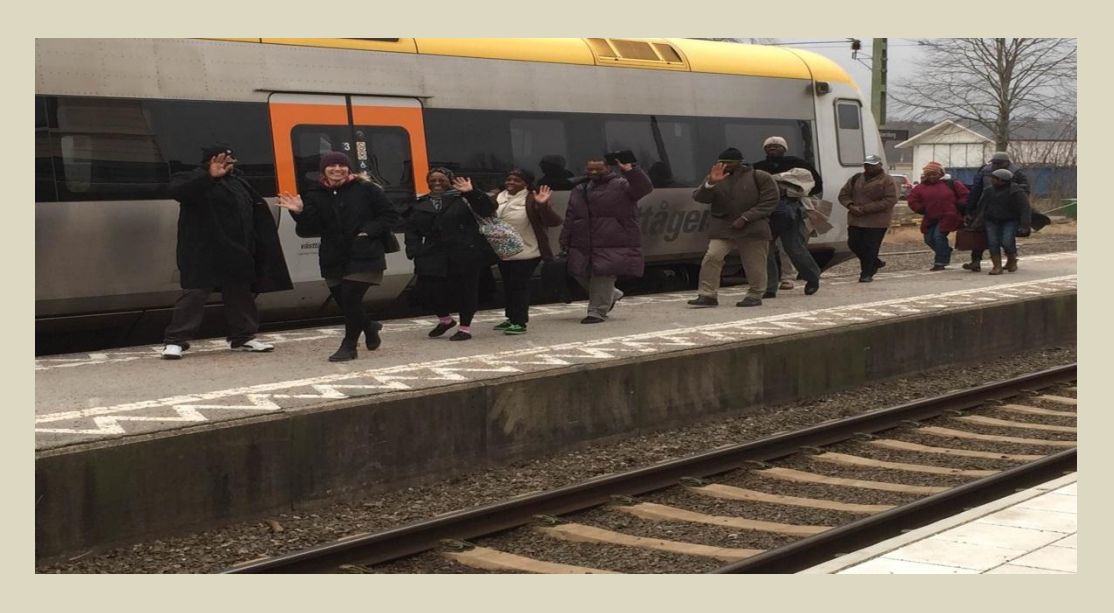
Chobe District Council delegation leaving Vasteros